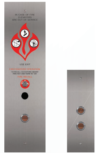
Hall Terminals with and without Fire Service with BS Copper pushbuttons