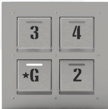
Toe-To-Go foot-activated call buttons, available in Stainless Steel or PVD Brass.