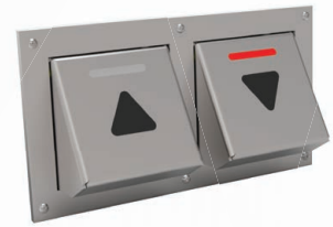
Hall stations, surface or flush mount, available in Stainless Steel or PVD Brass.