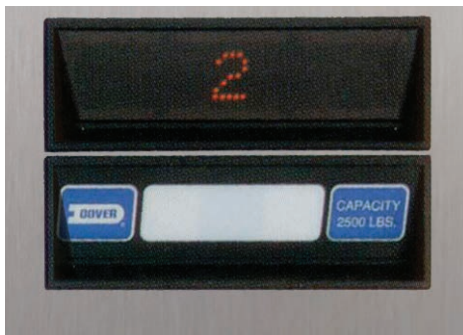
Before Impulse+ retrofit