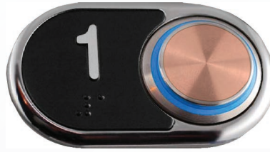
BS Copper pushbutton with Julius surround