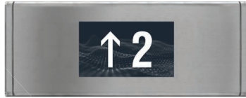
Hall Position Indicators with and without arrows. Standard and custom graphics shown.