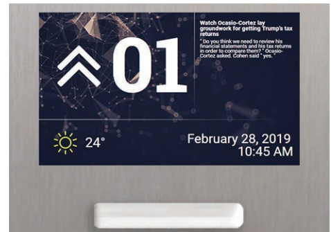
10" MosaicONE Matisse PI

This publication is for general informational purposes only. Product design is subject to change without notice. Actual product colors, finishes and specifications may vary from graphical representations.