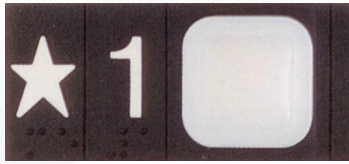
Impulse Fixture pushbutton