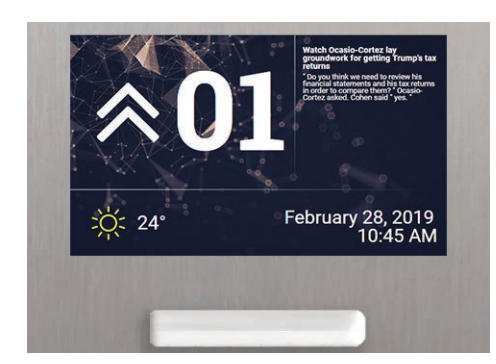
10" MosaicONE Matisse Pl

This publication is for general informational purposes only. Product design is subject to change without notice. Actual product colors, finishes and specifications may vary from graphical representations.