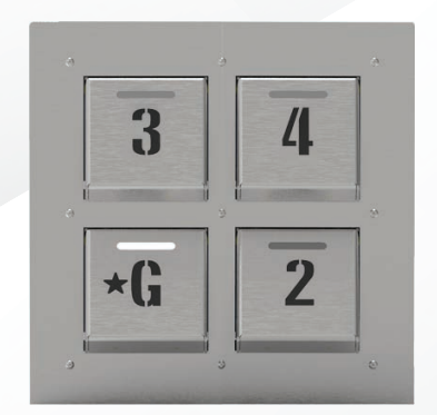
Toe-To-Go foot-activated call buttons, available in Stainless Steel or PVD Brass.

Hall Position Indicators with and without arrows. Standard and custom graphics shown.