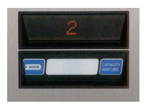
Before Impulse+ retrofit